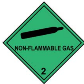
Figure 3 Nonflammable Gas Shipping Label

DOT Shipping Name: Helium, Refrigerated Liquid, 2.2, UN 1963