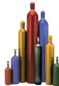
Figure 1 Typical Cylinder Shapes and Sizes

Cylinders may be used individually or in groups. When in groups, the cylinders should be piped together for stationary storage or to form portable banks.