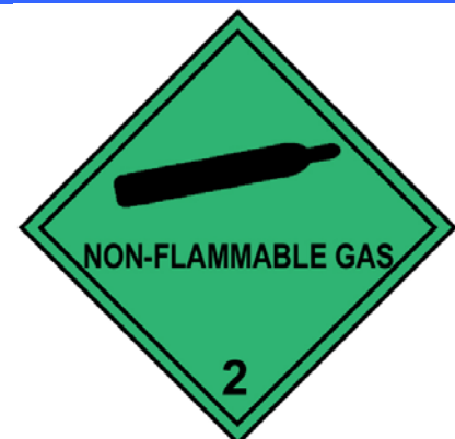
Figure 4 Nonflammable Gas Shipping Label