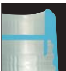
Specially designed polypropylene inner lip ensures leakproof seal.