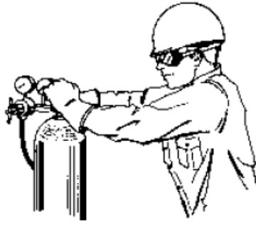
Figure 2 The correct way to safety check a system

Because oxidizers change the chemistry of fire, a material that does not burn in air may ignite or react violently in an oxidizer atmosphere. Equipment used in oxidizer service should be selected with materials of construction that minimize the probability of ignition and the risk of fire or explosion. This equipment must be cleaned to remove any contaminants such as oils or grease. Care must also be taken to eliminate any residual cleaning agents. Regulators used in oxygen service should be maintained exclusively in oxidizer service. If a regulator is used in other types of service, it may no longer meet oxidizer clean requirements.