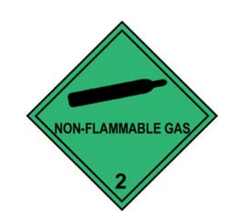
Figure 3 Nonflammable Gas Shipping Label

DOT Shipping Name: Helium, Refrigerated Liquid, 2.2, UN 1963