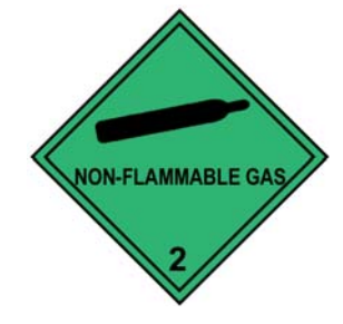
Figure 4 Nonflammable Gas Shipping Label