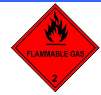
Figure 4 Flammable Gas Shipping Label