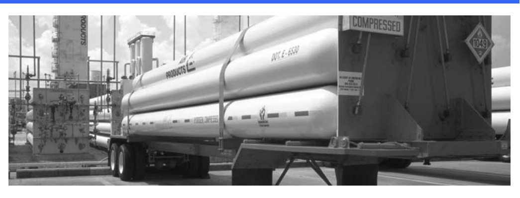
Figure 2 A Typical Tube Container System for Bulk Gas