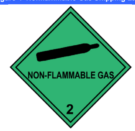
Figure 4 Nonflammable Gas Shipping Label