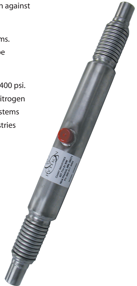
Chart (formerly CVI and MVE) has over 45 years of excellence and innovation in cryogenic product technology. Python piping is quite simply the best product and the best value on the market. Contact us today to see how Python piping can make your application more efficient.

Python piping is designed for temperatures down to -350° F and pressures up to 400 psi. Python systems can be modified and adapted to many applications from liquid nitrogen to chilled water. Python piping is ideal for highly temperature-sensitive piping systems found in the petrochemical, energy, manufacturing, and food and beverage industries around the world.